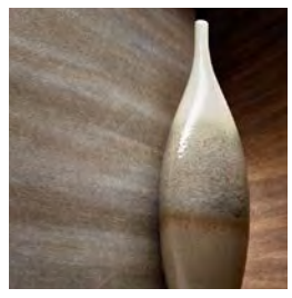
FOR SIMILAR DESIGNS CLICK HERE

Type II 20 oz | Width: 52"/54" | Backing: Non-Woven | Match: Reversible Straight Across Match Repeat 54"H x 36"V | Fire Rating: Class A | Flame Spread: 10 | Smoke Development: 10