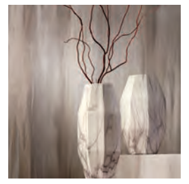
FOR FARRAH COODINATE CLICK HERE