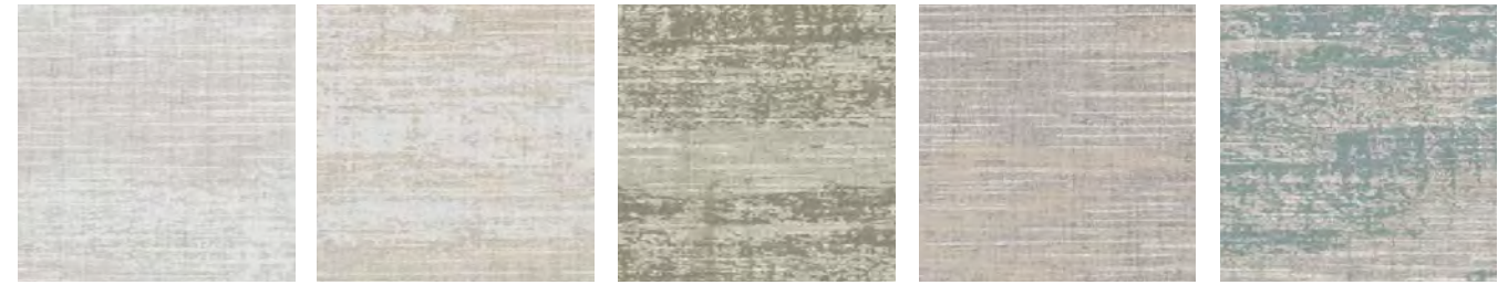
CD2-GHO-01 Cirrus Cloud CD2-GHO-02 Cement Mix CD2-GHO-03 Lichen You CD2-GHO-04 Sustainable CD2-GHO-05 Oar