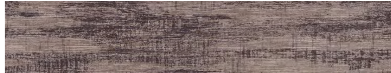
CD2-GHO-16 Carbon Star