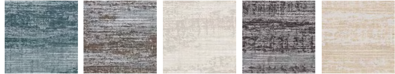
CD2-GHO-06 Ionian Sea CD2-GHO-07 Arctic Char CD2-GHO-08 Varnished White CD2-GHO-09 Nocitlucent CD2-GHO-10 Indigenous