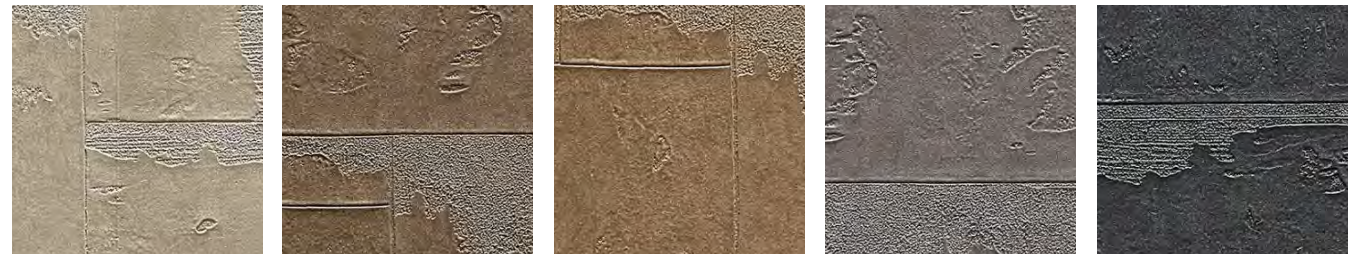
CD2-MAG-16 Cinta Muraria CD2-MAG-17 Castrano CD2-MAG-18Morrone Chiaro CD2-MAG-19 Fortezza CD2-MAG-20 Nero