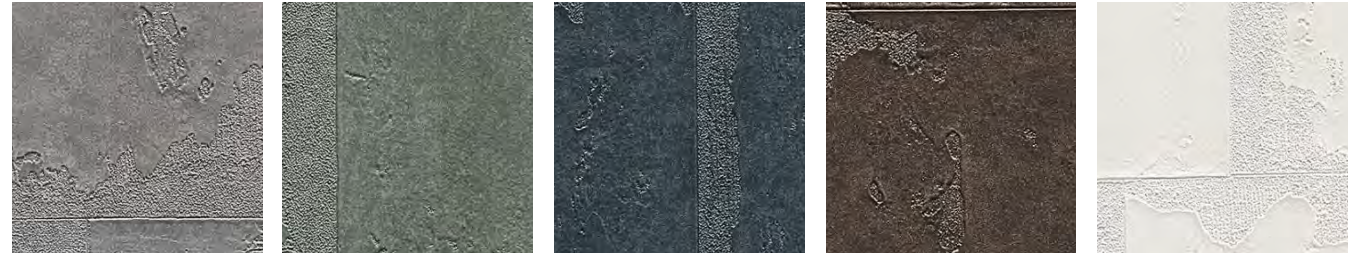
CD2-MAG-06 Delfino CD2-MAG-07 Verde Oliva CD2-MAG-08 Belle Notte CD2-MAG-09 Saturina CD2-MAG-10 Bianco