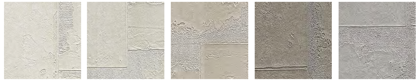
CD2-MAG-01 Fontana CD2-MAG-02 Nebbia CD2-MAG-03 Ciottolo CD2-MAG-04 Pietra CD2-MAG-05 Grigio