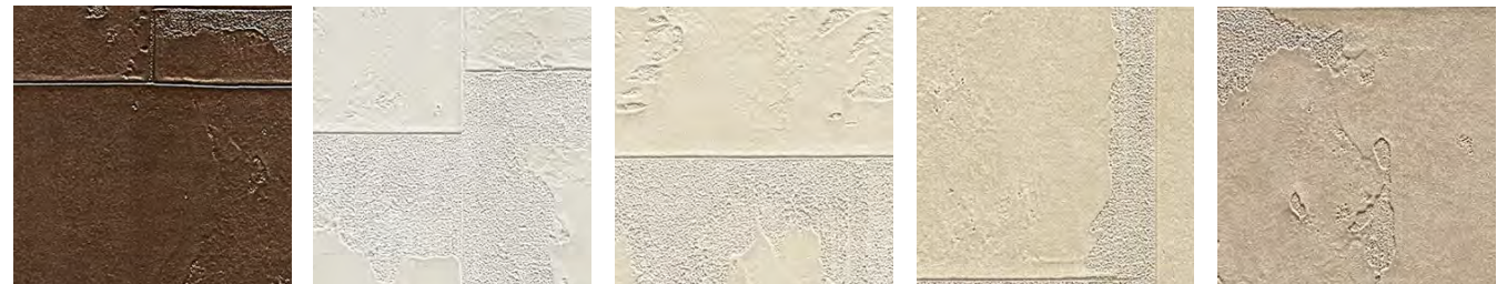
CD2-MAG-11 Bronzo CD2-MAG-12 Gemma CD2-MAG-13 Palazzo CD2-MAG-14 Villa Toscana CD2-MAG-15 San Bruzio